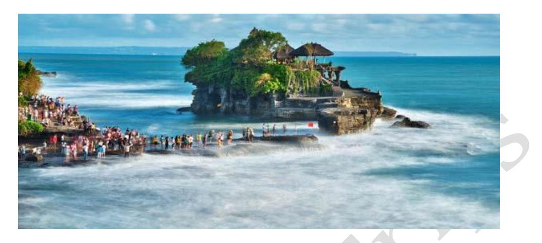
Day 3 : Bali, Fullday tour to Mengwi, Alas Kedaton, Tanah Lot

After breakfast, Fullday tour to Mengwi, Alas Kedaton, Tanah Lot.