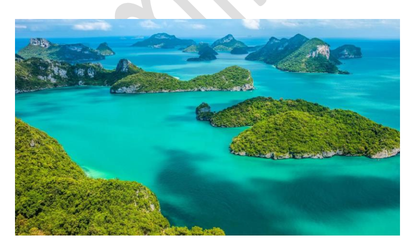
Day 2:- Koh Samui Island Tour