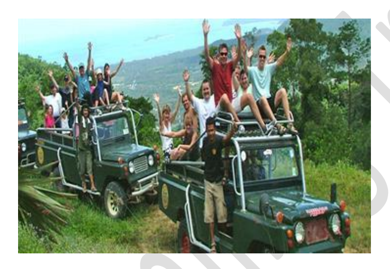
Day 3:- Koh Samui, Adventure Safari Tour

Breakfast in the hotel. After breakfast leave for Half Day Adventure Safari Tour inclusive of lunch.